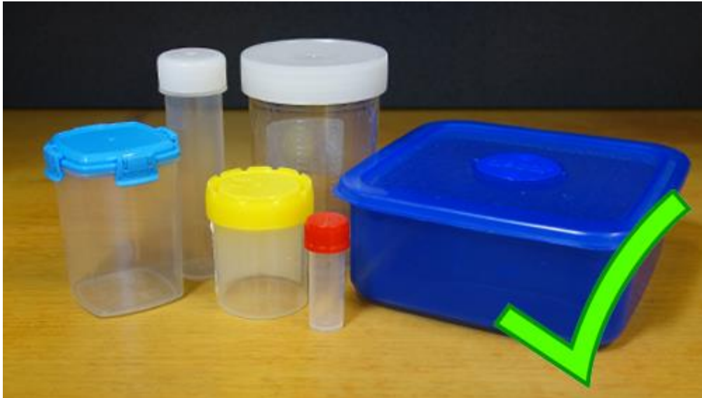
Examples of non-crushable plastic containers to send in live insects.